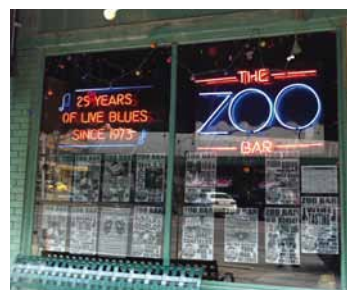
The Zoo Bar