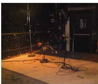
Empty Stage in the Zoo Bar