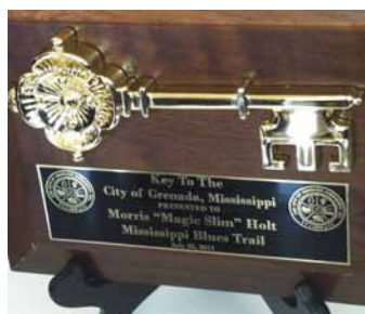
Key to the City of Granada, Mississippi