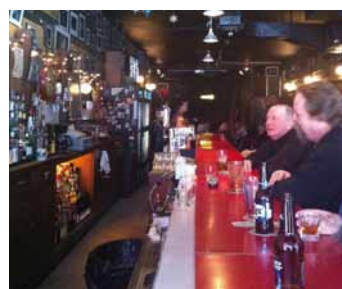
The Zoo Bar